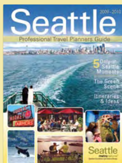
Advertise in these SCVB Publications

“Bell Harbor has been a member of Seattle’s Convention and Visitors Bureau since we opened in 1996. The bureau has been a fantastic partner providing valuable information, ongoing support but most importantly, they have brought us valuable business from around the country that we could never have found on our own. I highly recommend becoming a member of the SCVB!”